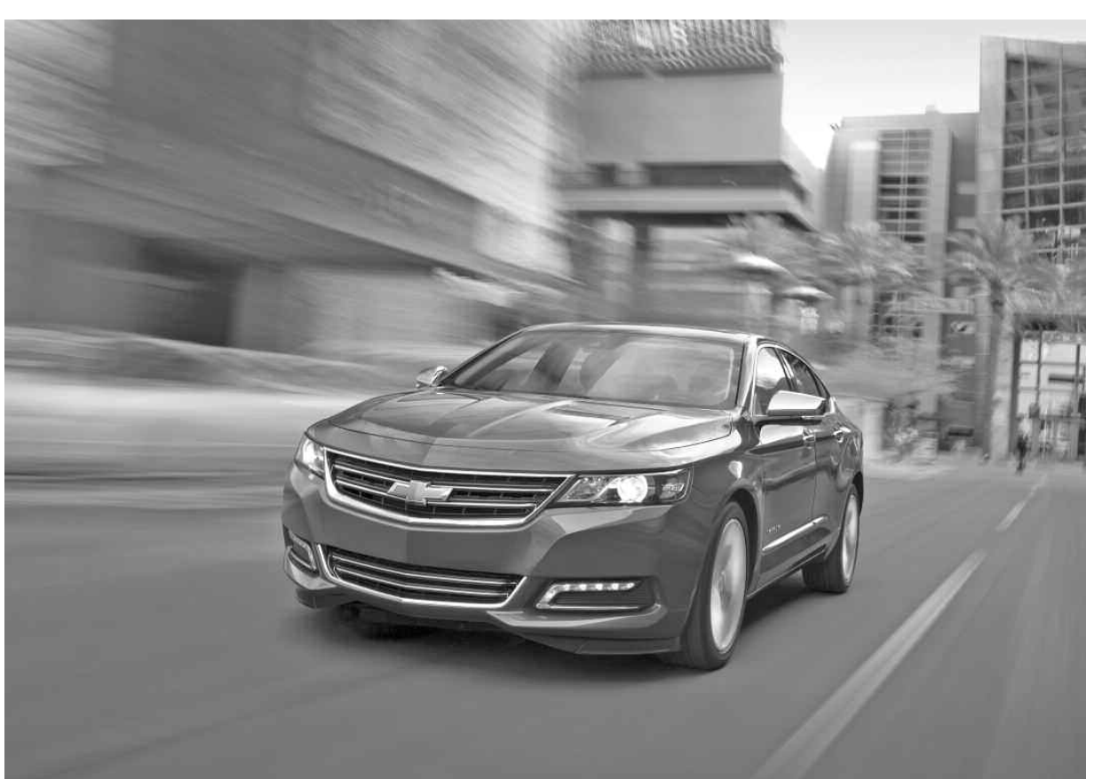
Pack up the family and your peace of mind – the Chevrolet Impala sedan (shown here) and Tahoe and Suburban full-size SUVs were recently recommended for families in new rankings by Kelley Blue Book and U.S. News & World Report.