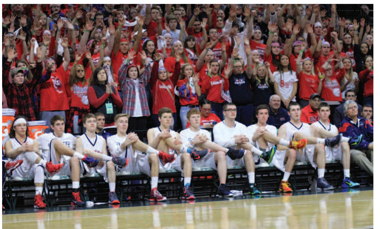
The MSU Breslin Center was filled with Red and Blue from Boyne City, including a very loud and supportive student section.