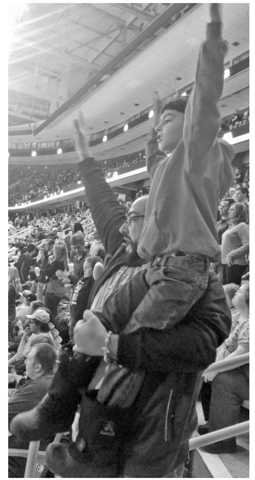
RIGHT: Char-Em United Way sent 16 community volunteers and their guests, to the Palace of Auburn Hills to watch the Detroit Pistons take on the Chicago Bulls on March 21 as part of the statewide Game Changers Program.

program and, with so much positive feedback, the organization hopes to offer it again in the future. To find volunteer opportunities and register as a local volunteer, visit Volunteer Connections by going to www.charemunitedway.org and clicking on "VOLUNTEER" or call the United Way office 231-487-1006 for more information.